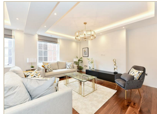
Portman Square Approx. Gross Internal Area 1169 Sq Ft - 108.60 Sq M